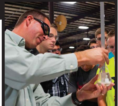
Photo: Nature Coast High School students reviewing a cleaning solution used in the powder coating process.

Read more about Manufacturing Day in the Tampa Bay Times!