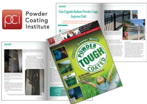
Fall Issue of Powder Coated Tough Magazine

When this Florida-based fence and railing maker needed a more reliable powder coating application system, they turned to ITW Gema.