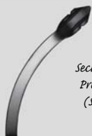
Security Grade Pressed Spear (Standard)